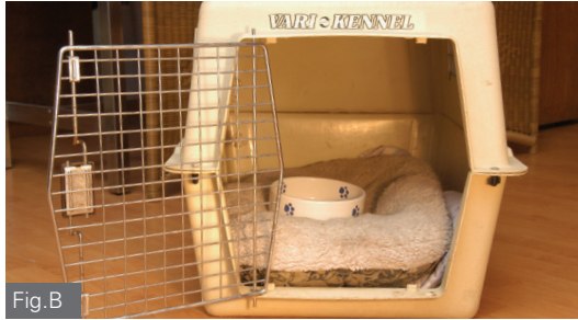
Fig.B: When he's comfortably eating his meals in this new location, move the food just inside the crate so he has to stick his head in to eat. If he's the type of dog who will get scared if he hits the door when going in or out, start with the door removed from the crate.