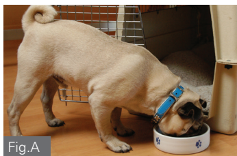
Fig.A: If your dog really dislikes being confined, start by feeding his daily meals just outside the crate.

Training pets to see their crate or carrier as their personal bedroom is simple even for cranky canines and adult dogs, and usually takes less than a week. It's all about teaching them that great things happen when they're in their crate (classical conditioning). The great thing we will use is food. Throughout the process, other motivators can be used, as well.