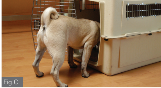
Fig.C: Your dog should readily stick his head inside the crate. If he's comfortable, he'll eat his entire meal without backing out to look around.