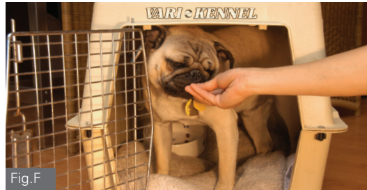
Fig.F: Once your dog is finished with his meal, give him several treats (or kibble) in a row to encourage him to wait in his crate rather than dart out. If your dog is the type to dart out, shove the treat right into his face so that your hand and the treat act like a stop sign blocking his exit.