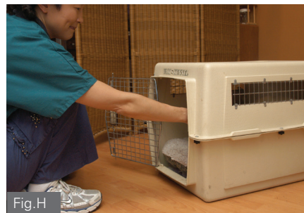
Fig.H: When giving the treat, reach into the crate and put the treat all the way up to your dog's face, so that you don't accidentally make him come forward out of the crate to get it.