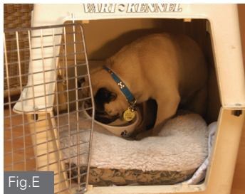
Fig.E: For most dogs, reaching this point takes less than 3 days of twice-daily feedings.