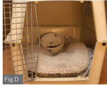
Fig.D: Gradually move the food dish farther inside the crate until the dog easily goes all the way into the crate.