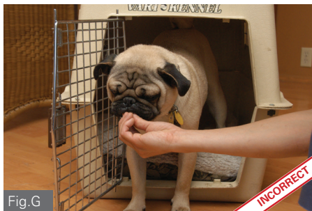
Fig.G, Incorrect: This dog is getting rewarded for walking half-way out of the crate. If your dog is coming out of the crate, either you aren't delivering the treat far enough into the crate or you're delivering the treat too slowly, which makes him think you want him to come out to grab it.